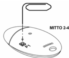
Old type Mitto

(If it has no hidden button use the top two front buttons together instead)